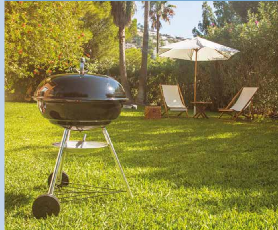
Party lawn with BBQ zone

Shooting the ball in the basket becomes all the more interesting when it's surrounded by such an amazing view around. We give you not just a basketball court but one on the rooftop.