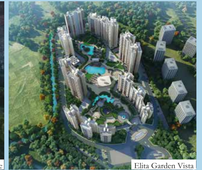
Elita Garden Vista