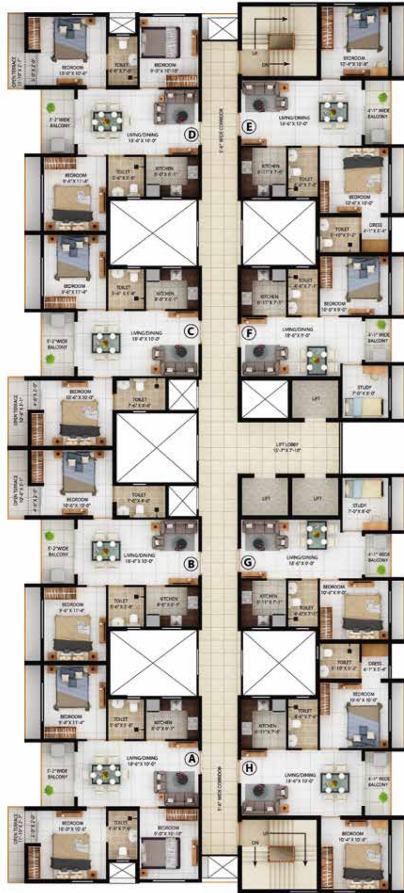
FLOOR PLAN | BLOCK-1: 2nd Floor