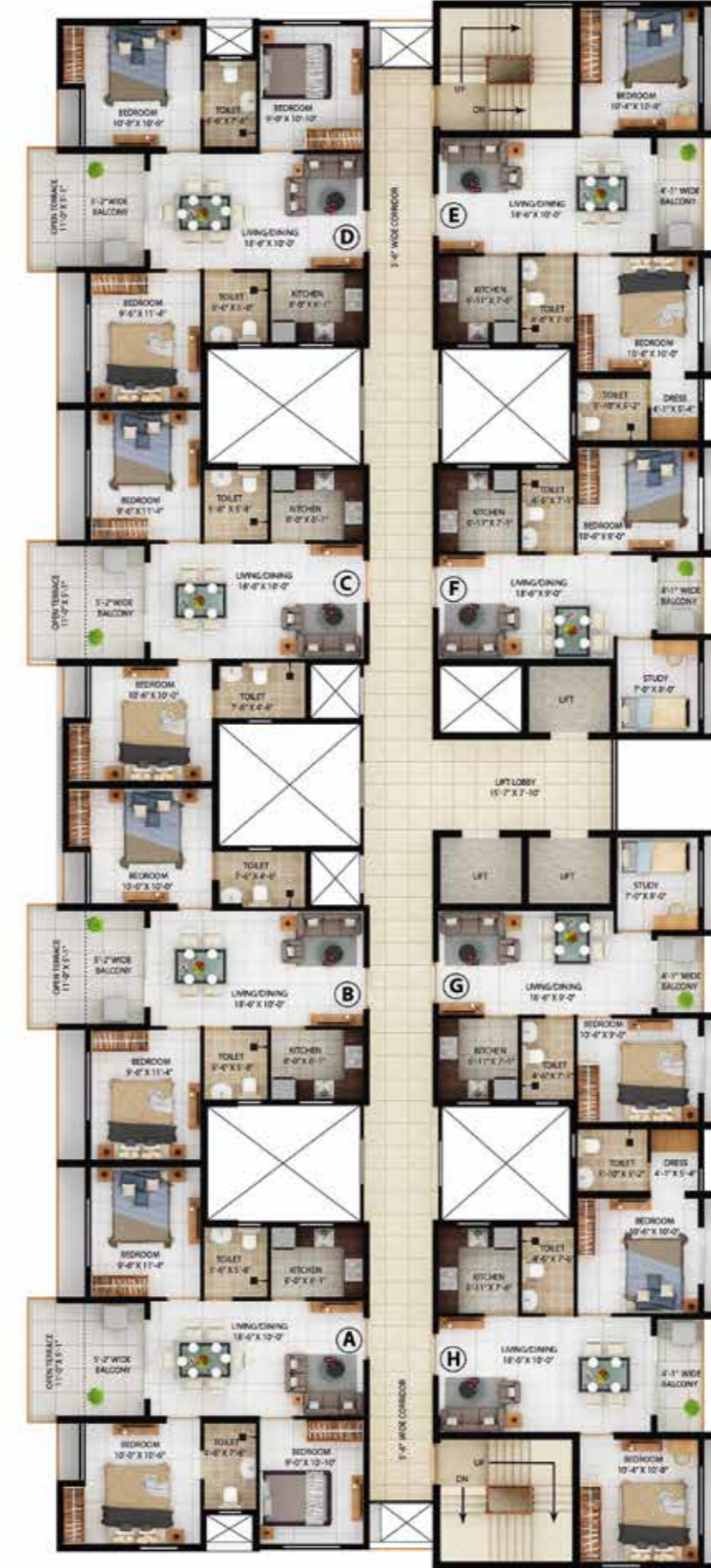
FLOOR PLAN | BLOCK-1: 3rd Floor