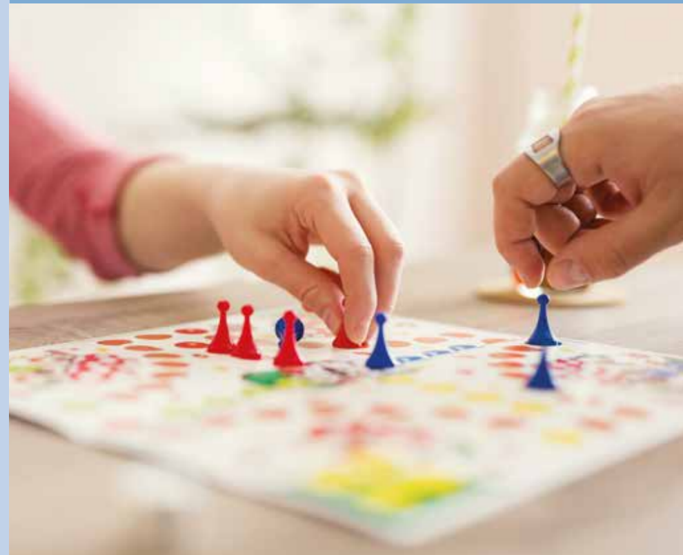
Board game zone

Your search for peace and relaxation ends here at our Sunken Deck where the view is memorises you.