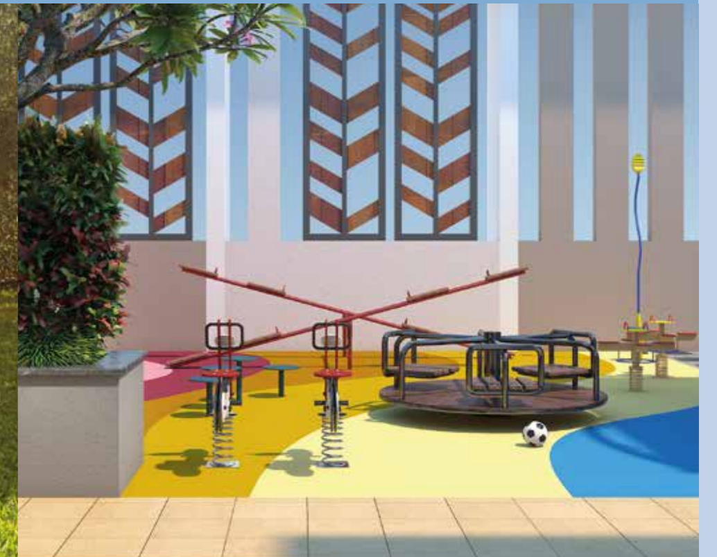
Kids Play Zone

The party you can throw at the Party Lawn with BBQ zone would set just the right vibe. The smell of barbeque just makes it better.