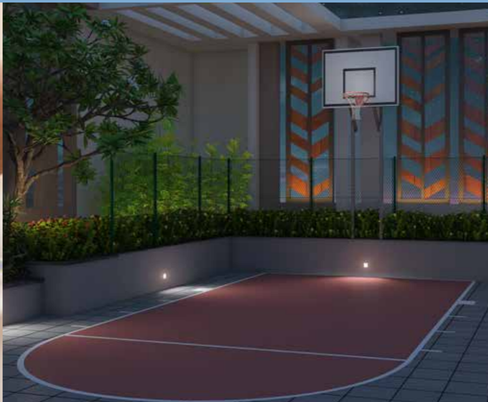
Rooftop half Basketball court

Allow your mind to engage in amusing gameplay with our special Board game zone. Keeping your focus laser sharp it's always get to keep your mind refreshed.