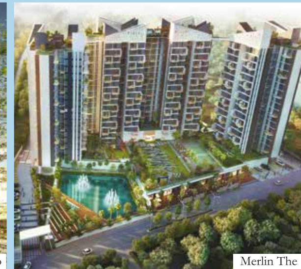
Merlin The 1