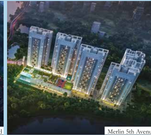
Merlin 5th Avenue